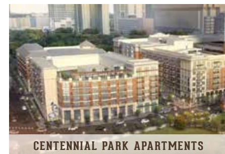
CENTENNIAL PARK APARTMENTS